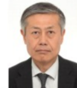
Hon. Yoshiaki Miawa Consul General of Japanese Consulate Office in Davao City