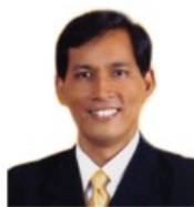
Go, Ronald C. Car Rentals